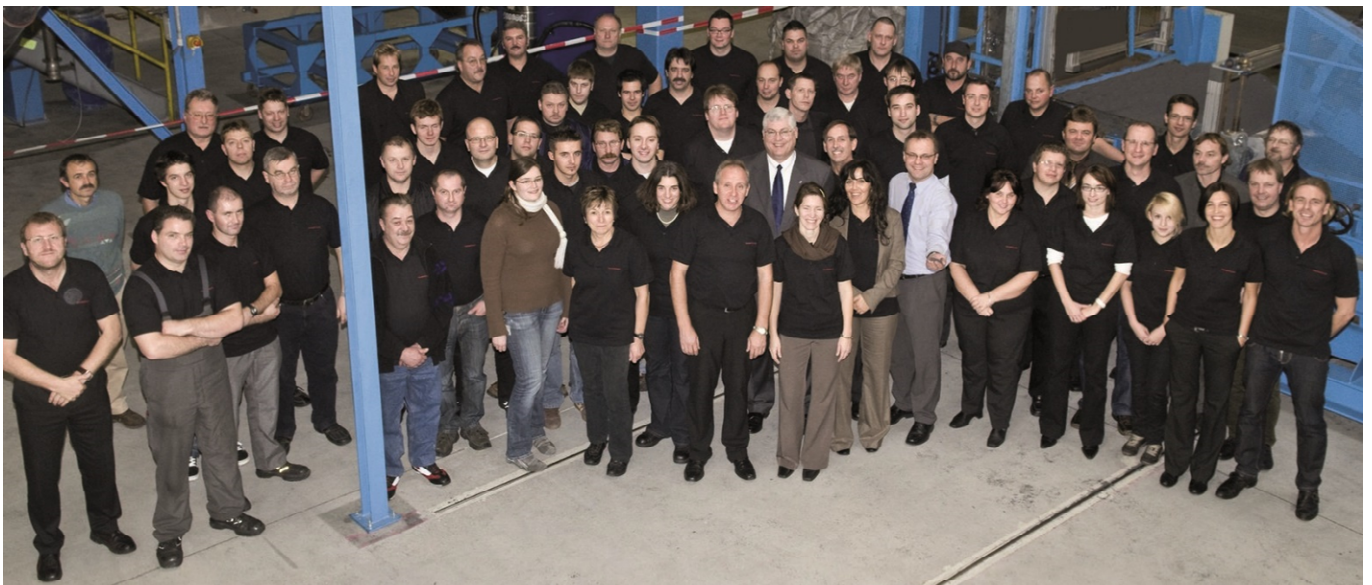
The SIGRAFLEX® team during the inauguration of the 2 nd production line in Meitingen

In addition to its established business in graphite sealing materials, where SGL Carbon continued to be the market leader in the 2000s, as well as intensively developing new products and driving growth, the company was also looking for other applications for products made of flexible graphite.